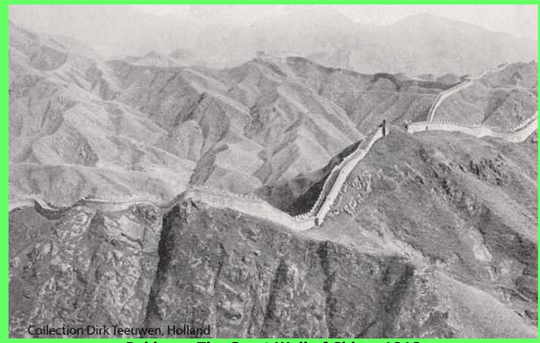
Peking > The Great Wall of China, 1918