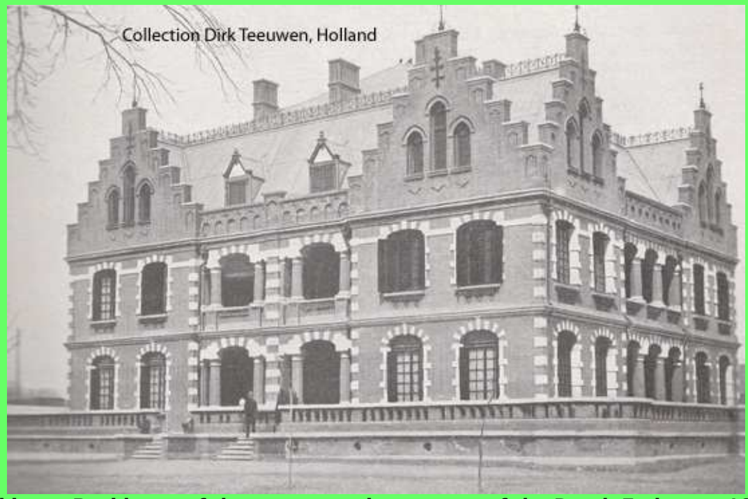
Peking > Residence of the secretary- interpreter of the Dutch Embassy, 1918