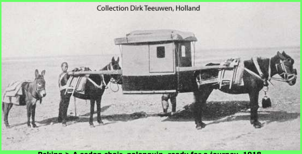
Peking > A sedan chair, palanquin, ready for a journey, 1918 From "Indië", p. 469