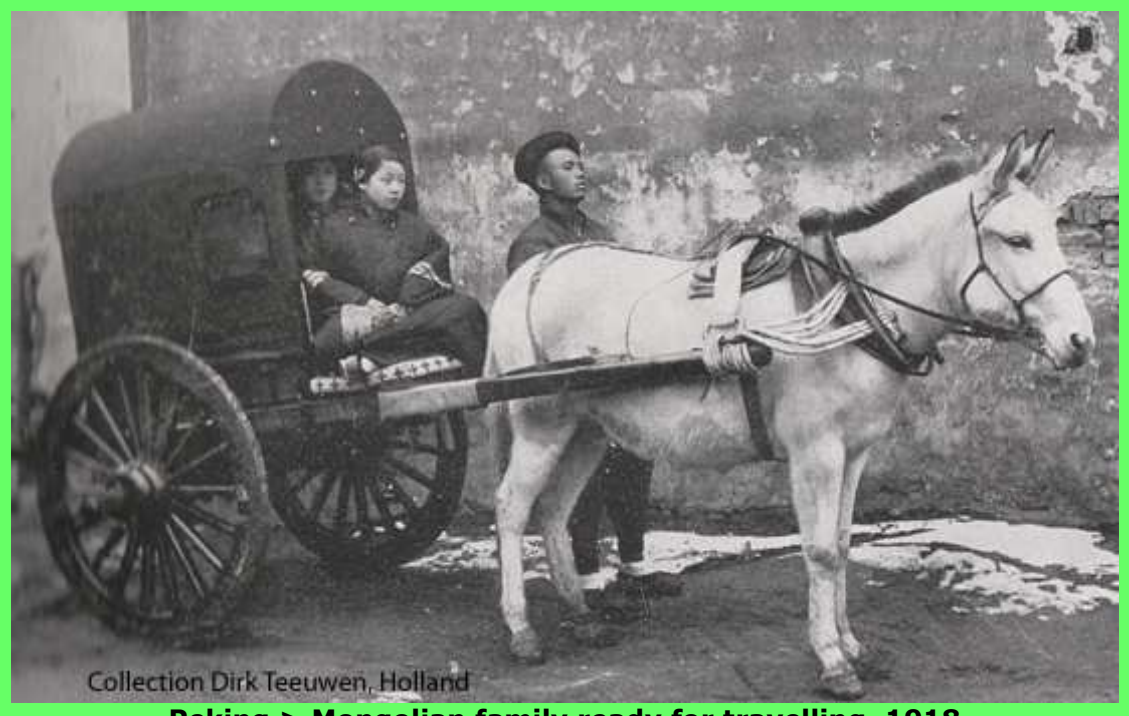
Peking > Mongolian family ready for travelling, 1918 From "Indie", p. 471