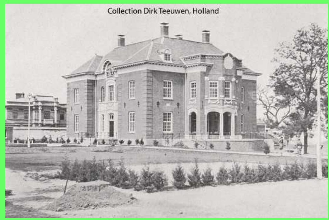
Peking > Dutch Embassy, 1918 From Indië, p. 406