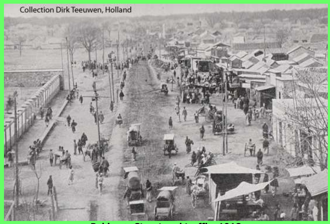
Peking > Street and traffic, 1918 From "Indië", p. 409