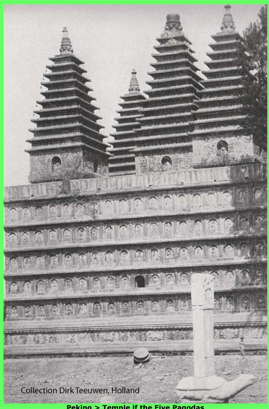
Peking > Temple if the Five Pagodas