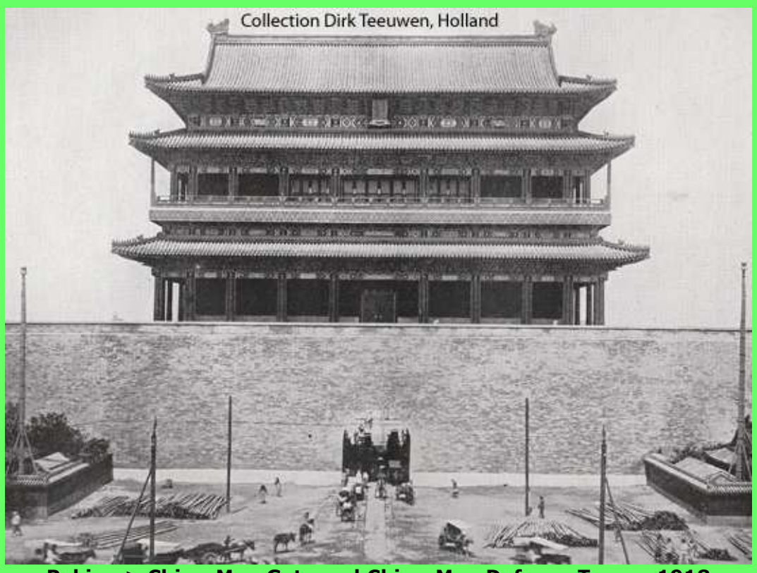
Peking > Chien-Men Gate and Chien-Men Defense Tower, 1918 From "Indië", p. 404