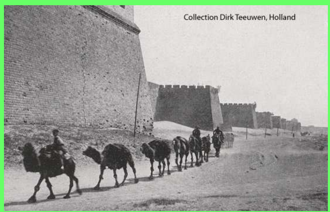
Peking > City wall and caravan, 1918 From "Indië", p. 408