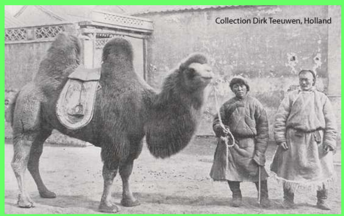
Peking > Mongolian camel man, rider, 1918 From "Indië", p. 470