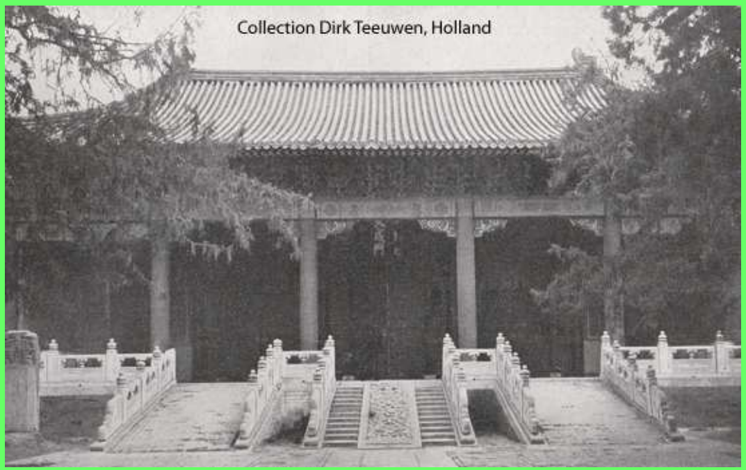
Peking > Confucius Temple, 1918 From "Indië", p. 436