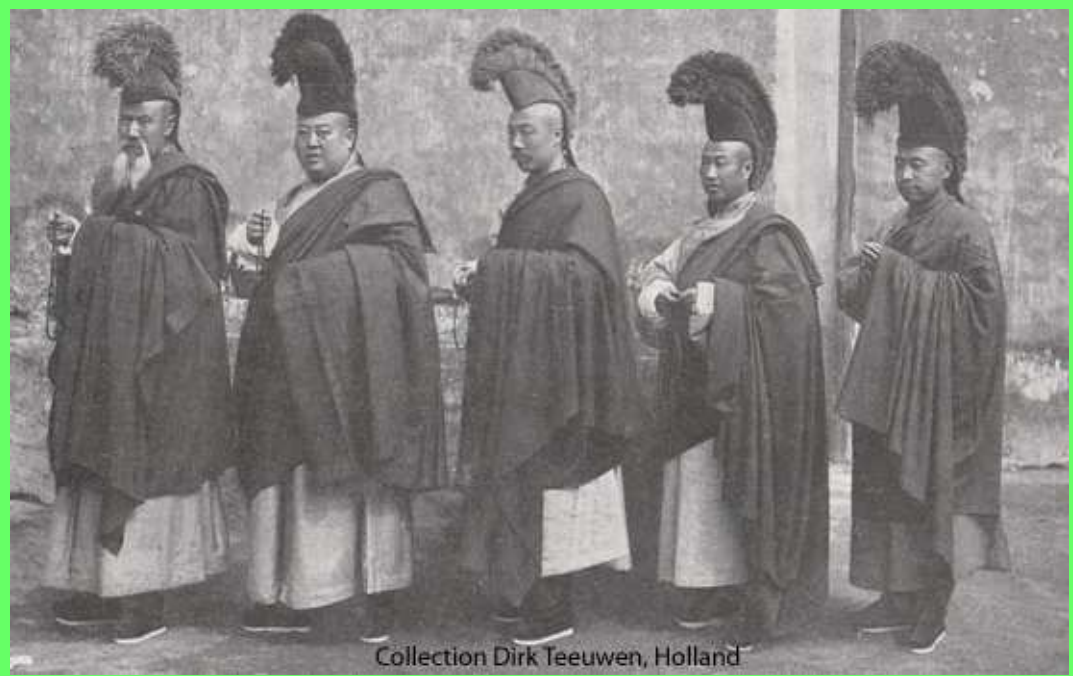
Peking > Lama priests, 1918