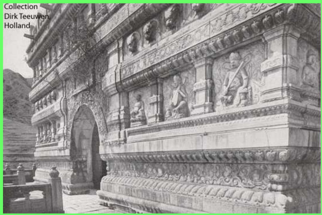
Peking > One of the walls of the Pi-Yen-Tsé Temple, 1918