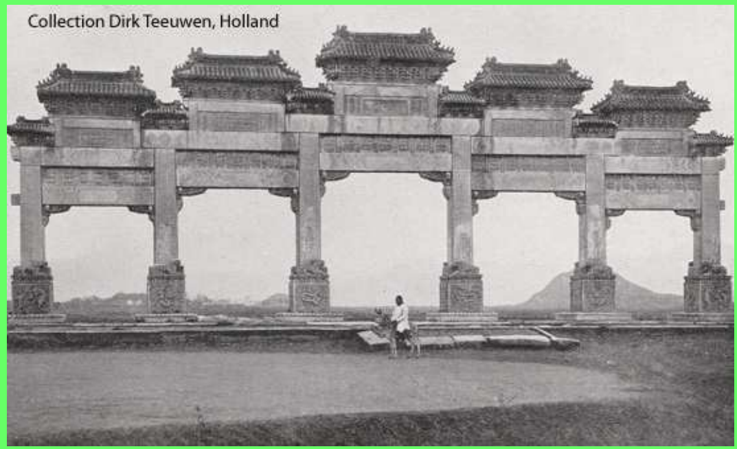
Peking > The gate of the Ming Cemetery, 1918