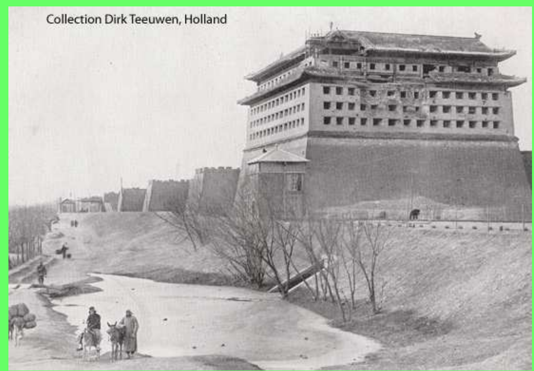
Peking > City Walls and fortress, 1918