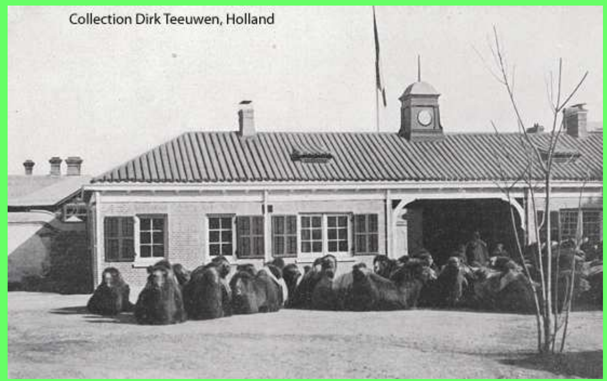
Peking > Caravan camels rest at one of the the entrance gates of the Dutch Embassy, 1918 From "Indië", p. 468